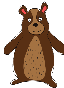
BEARS 10-12 years old 3:1 ratio

MONDAY-FRIDAY 9:00 A.M. - 4:00 P.M. JULY 8 - AUGUST 30 COST $425 PER WEEK*